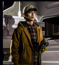
COMMERCIAL TRUCK DRIVER