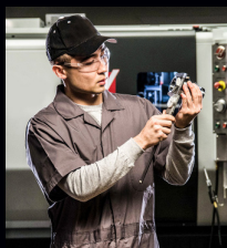
TOOL & DIE MAKER